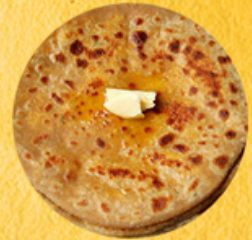
Thepla & Bhakhri